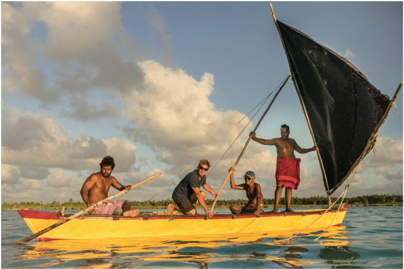
THE ISLANDERS EXPLORED VAST EXPANSES OF THE PACIFIC, NAVIGATING WITHOUT INSTRUMENTS, SOMETIMES CROSSING HUNDREDS OF MILES OF OPEN OCEAN. ABEMAMA ISLAND, KIRIBATI

W e manage to pin this busy globe-trotting adventurer down for just a moment, to talk about his passion, inspiration and drive. We talk about the most gritty, dangerous and rewarding parts of his massive journey of touring the Pacific to bring us the incredible documentary series that is My Pacific Quest .